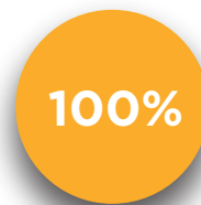
■ Tax-Exempt Dividends